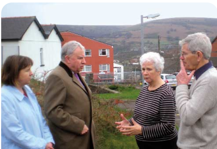
Meeting local representatives to discuss illegal bike use

Paul Murphy MP has called for action to tackle the illegal use of off-road vehicles in our area.